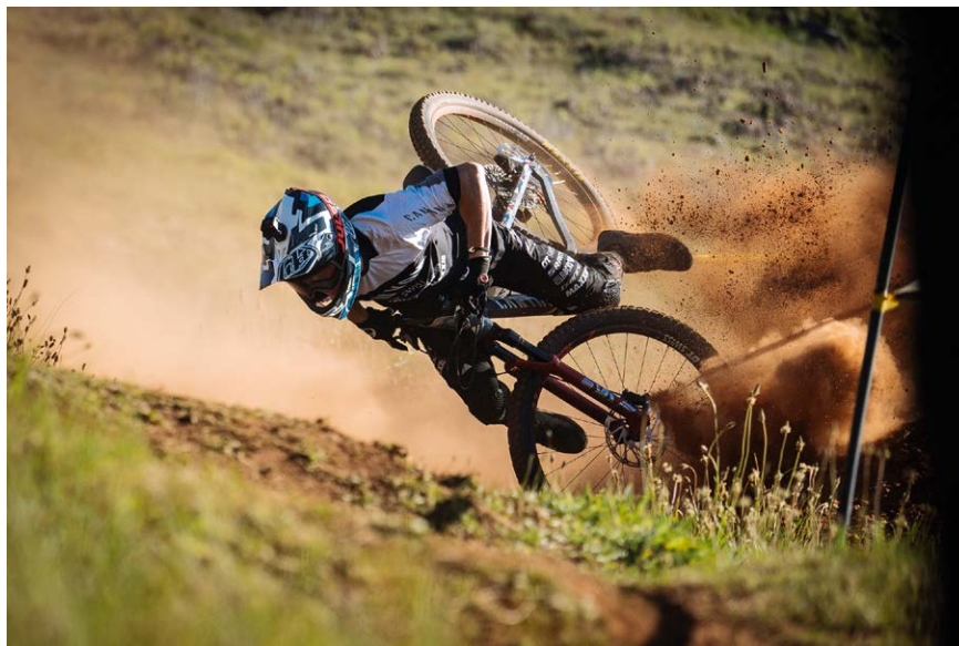
► Fig. 2 Injuries occurred most frequently on steep, dirt/rocky stages.

race injury incidence in the present study was similar to the 43/1000 hours reported in downhill racing in the US [14] and higher than the 20/1000 hours reported in downhill riders from Germany, Luxembourg, Switzerland and Austria [17]. The rate of injury was also higher compared to that reported previously in cross-country mountain bike racing (4.0/1000 hours racing) [8].